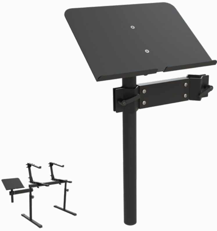
SKU: 59204-005| QUASSIA TABLETA SET - TABLET HOLDER

length : 45,00 CM depth : 27,50 CM weight : 2,37 KG