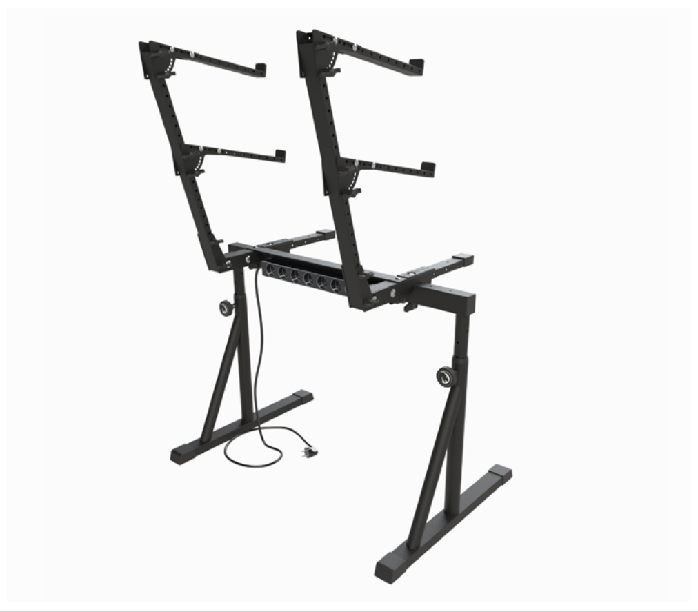
SKU: 62058 | PARA S PLUS

A 3-tier keyboard stand designed for heavy synthesizers, with additional diagonal brace. With built-in 8-way power strip bracket, customizable storage, and side mount compatibility, it's the choice for serious synth enthusiasts.