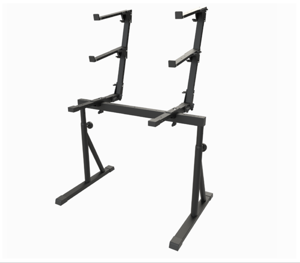
SKU: 62057 | PARA PLUS

Sturdy 3-tier keyboard setup with an additional diagonal brace, it provides extra stability for setups with heavy synthesizers to help prevent wobbling.