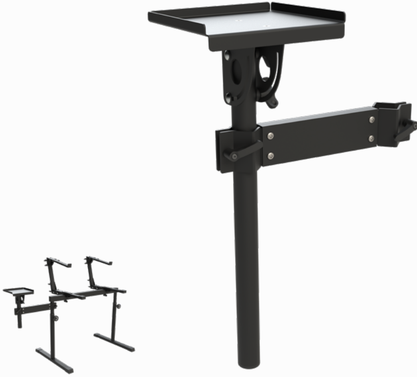
SKU: 59203-005 | QUASSIA ALTAVOZ SET - SPEAKER MOUNT

length : 30,00 CM depth : 22,50 CM weight : 2,05 KG