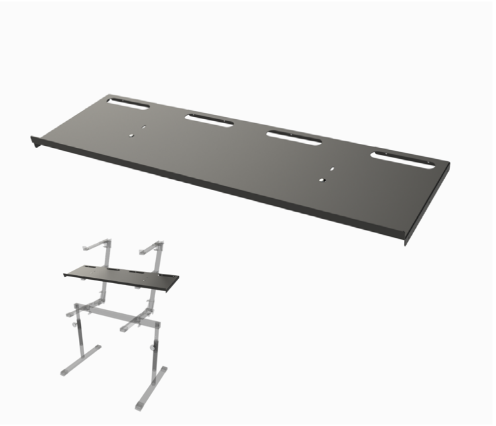
SKU: 8855 | FREIJO DOIS 1000 MM X 300 MM IN ALUMINUM A premium shelf measuring 1000 × 300 mm, finished in RAL9005 or RAL3003 matte, designed for 2nd and 3rd tier use. Each shelf comes with a complete set of fixing accessories.