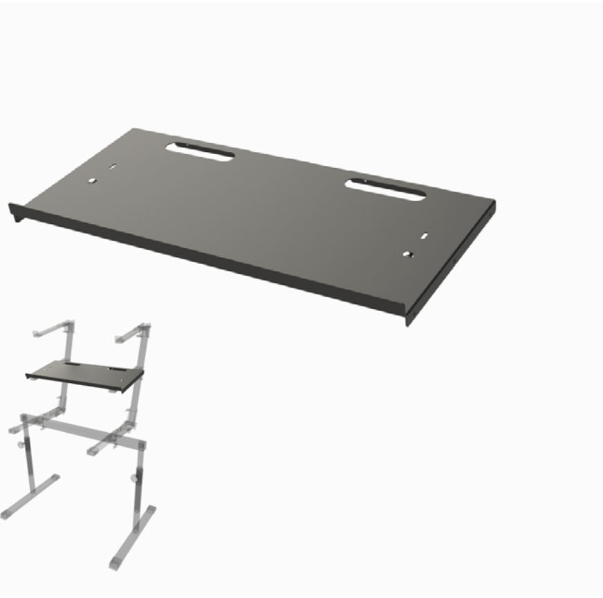
SKU: 8854 | FREIJO UM 650 MM X 300 MM ALUMINUM A sturdy shelf measuring 650mm x 30mm, finished in RAL9005 or RAL3003 matte for 2nd & 3rd tier. Each shelf includes a comprehensive fastening accessories set Perfect for smaller synthesizers.