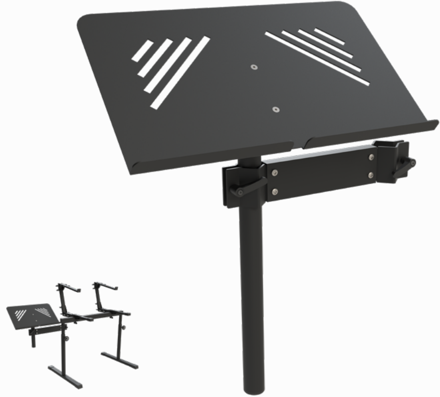
SKU: 59205-005 | QUASSIA NOTA SET - LAPTOP HOLDER

Attaches seamlessly to Black Panther keyboard stands, offering precise height and angle adjustments. Ideal for sheet music or smaller synths. Made of high-quality aluminum. With lateral mount set Iberoxo Braco 20 cm & Iberoxo Tubo 50 cm.