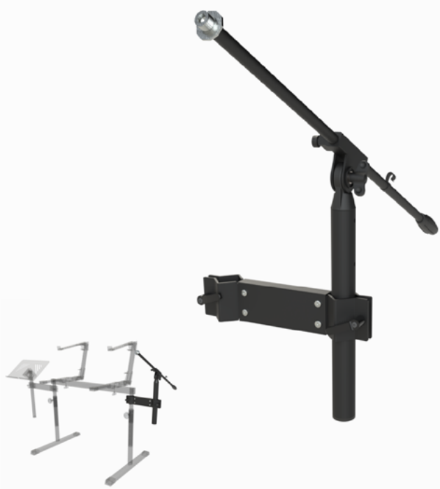
SKU: 61523-005 | MICROPHONE EXTENSION SET

length : 20,00 CM depth : 20,00 CM weight : 1,94 KG